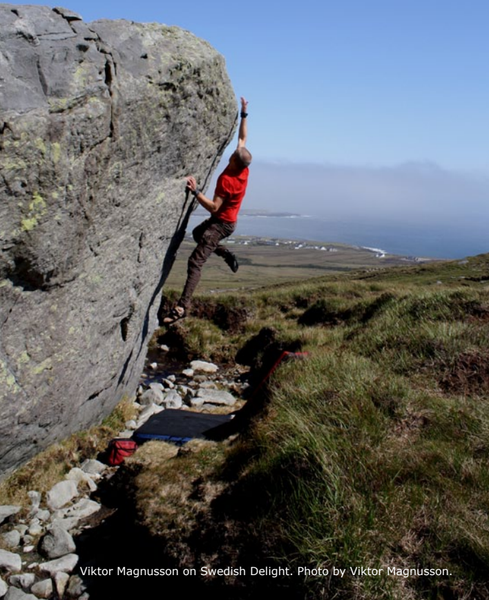
Viktor Magnusson on Swedish Delight.